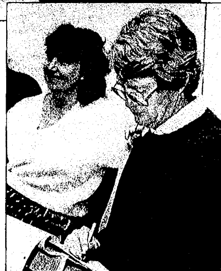
Scanning technology and data collection (left and top) were among the most popular topics at the Conference, which drew participants from all 50 states, the District of Columbia, and nine foreign countries.