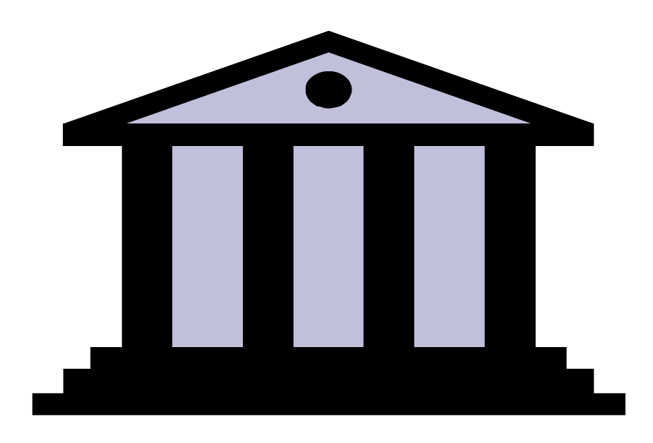
2005 The Judicial Education Reference, Information and Technical Transfer (JERITT) Project